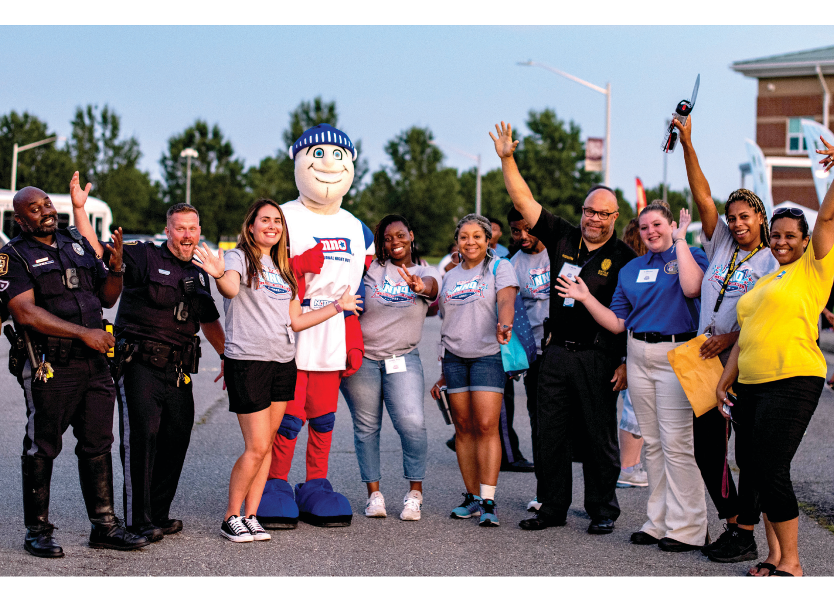
POLICE · COMMUNITY PARTNERSHIPS